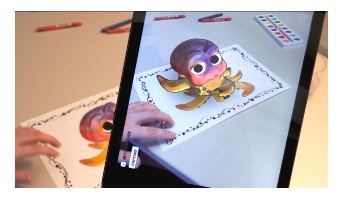
Figure 3: After coloring the octopus character, the user inspects the automatically textured 3-D model of the octopus on the iPad.

Coloring books capture the imagination of children and provide them with one of their earliest opportunities for creative expression. However, this activity suffers from the popularity of television and digital devices. For these reasons, we have developed an AR coloring book app.