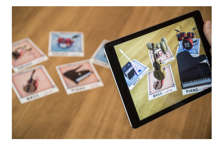
Figure 7: The user listens to the arrangement he or she just created using the markers on the table while observing the virtual instruments on the iPad.

Music is an integral part of human life and an important aspect of child development. We have developed an application that combines the endless creative dimensions of music with the intuitive spatial interactions offered by AR.