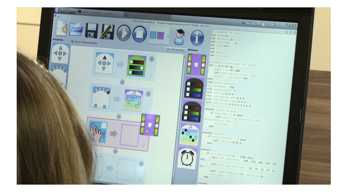
Figure 9: Authoring Interactive Narratives

gaming, for instance the creation of user-programmed non-playing characters, minions or pets; and a whole new class of competitive and collaborative games based on user-programmed agents.4 Conclusion