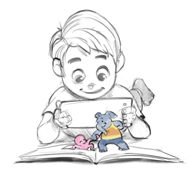
Figure 1: Creative AR apps permit children to engage their imagi nation as they explore and interact with the world around them.

AR holds unique potential to impact this situation by providing a